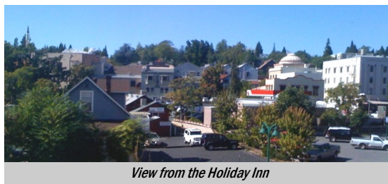
View from the Holiday Inn

I think everyone who attended the 2010 conference in Grass Valley came away feeling very lucky to have experienced this little gem nestled in the foothills of the Sierras. The streets of Old Town Grass Valley are lined with historic Victorian storefronts and art galleries. The town has a quaint but oddly sophisticated feel, with a diversity of cultures represented in the local cuisine. Attendees even got to try the local favorite, Cornish "pasties," on the last day of the conference. In addition, the small town atmosphere